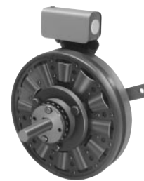
SFC (Stationary Field Clutch Coupling)