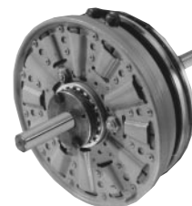
PCC (Primary Clutch Coupling)