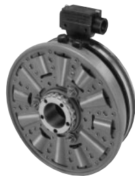
PC (Primary Clutch)