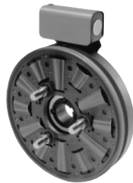
SF (Stationary Field Clutch)